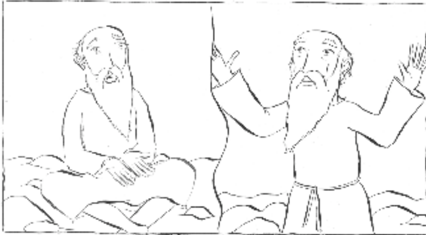
'I was blind but now I see!'

A man asks Jesus for healing. Jesus says that his faith has made him well. The man is now able to see and chooses to follow Jesus.