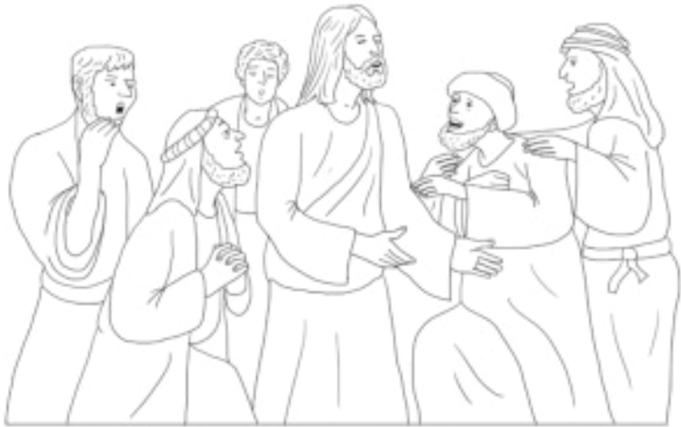
Jesus' disciples wanted to be powerful, he wanted them to serve others.

For Jesus, being the greatest means putting the needs of others before our own.